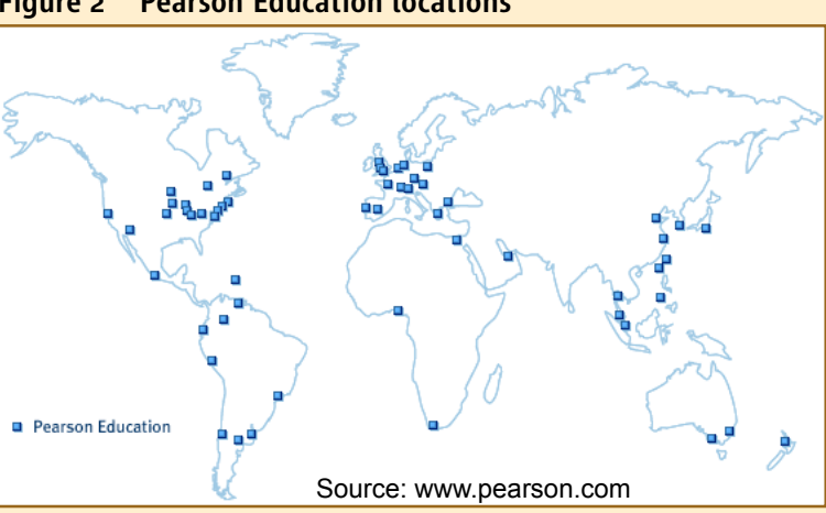
Figure 2 Pearson Education locations

employees can select their class schedule and class intensity and participation can be viewed as time worked, that is, the employee receives paid release time to attend classes on the clock. Employees in this category need English in their jobs because they need to make presentations in English, answer phone calls in English, engage in electronic communications in English, or require English in the performance of other job duties. Participation is deemed advisable when English is required only a few times per week to understand English e-mails and for an occasional telephone communication. Employees in this group are usually not expected to participate in oral presentations in English. Fifty percent release time is provided, which means that 50 percent of the class is on the company's time and 50 percent is on the employee's time. If employees work in jobs where English is hardly ever used, then employees attend classes 100 percent on their own time and preferences regarding schedule and intensity are very limited.