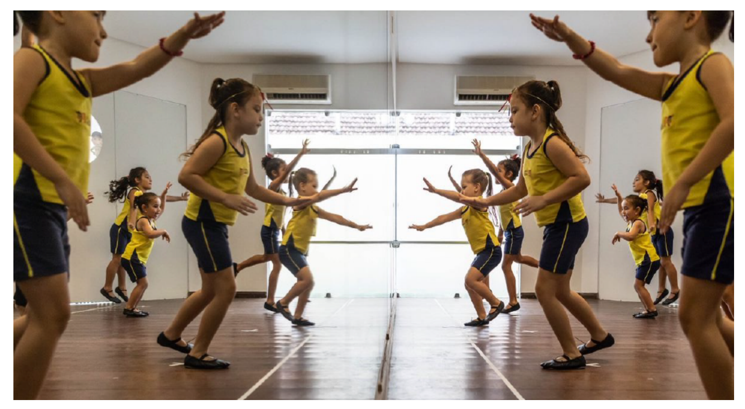
Girls learning to dance, Recife, Brazil